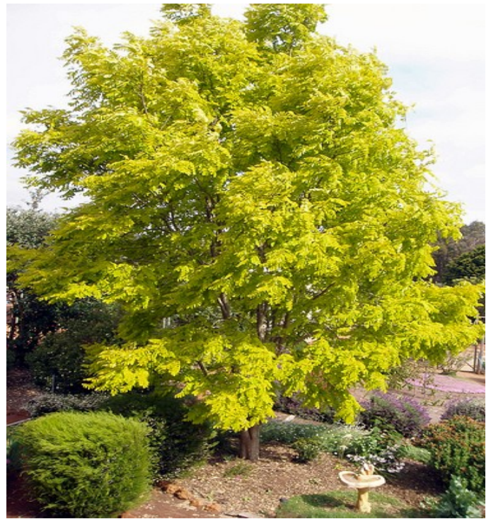
YGC favourite-Sunburst Honey Locust—beautiful chartreuse leaves.

How are your trees? To protect and maintain these landscaping and property anchors, keep them pruned, watered, fertilized and inspected for disease, insects and damage. Be sure you have done these tasks before you call in an arborist or rev up your chain saw.