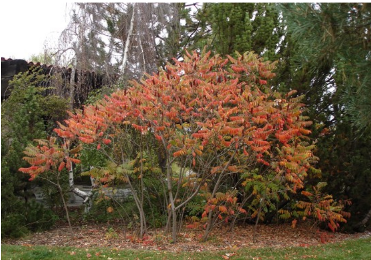
YGC favourite-Sumac (above)—produces clusters of deep red fruit (below) for a splash of fall colour and winter food for wildlife.