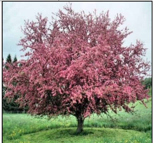
YGC favourite-Crab apple—pretty spring blooms and lovely aroma followed by summer fruit for

Stand tall and proud. Sink your roots into the earth. Be content with your natural beauty that just gets better as you age. Go out on a limb. Shelter those less strong and the young. Drink plenty of water. Remember your roots. Enjoy the view!.