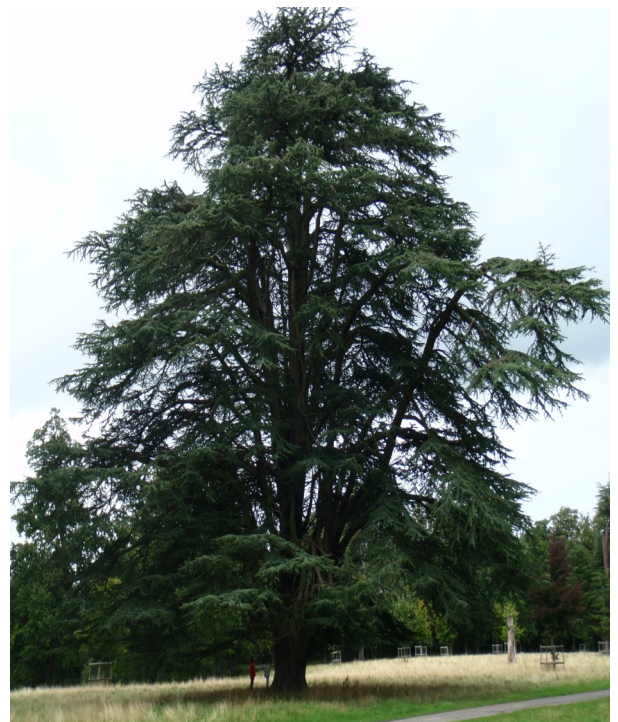
YGC favourite-Lebanese Cedar—beautiful shape, rarely found in Canada.